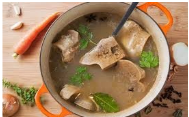
Bone Broth is popular and excellent for gut healing!